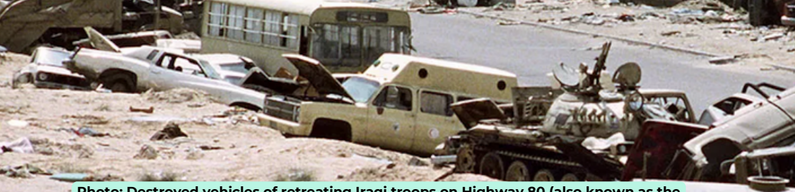
Photo: Destroyed vehicles of retreating Iraqi troops on Highway 80 (also known as the "Highway of Death") in Kuwait, April 1991