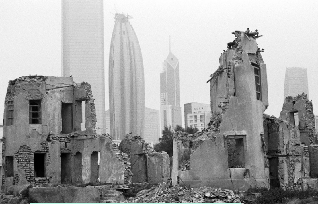
Photo: Sheikh Abdullah Al-Jabir Palace, damaged during the Iraqi invasion

Such claims covered the costs incurred by states in evacuating their citizens, providing them with aid, damages in connection with the destruction of diplomatic buildings, loss or damage to other state property, as well as environmental damage and depletion of natural resources in the Gulf region, including as a result of oil well fires and oil dumps into the sea.